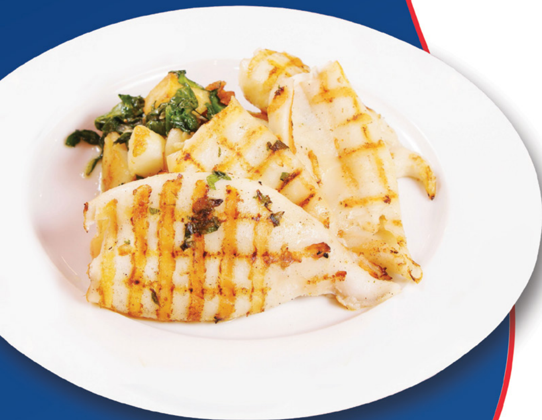
Grilled Calamari Tubes