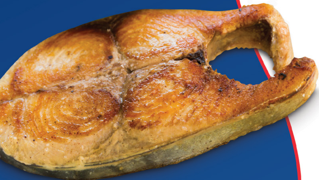
Sauteed Kingfish Steak