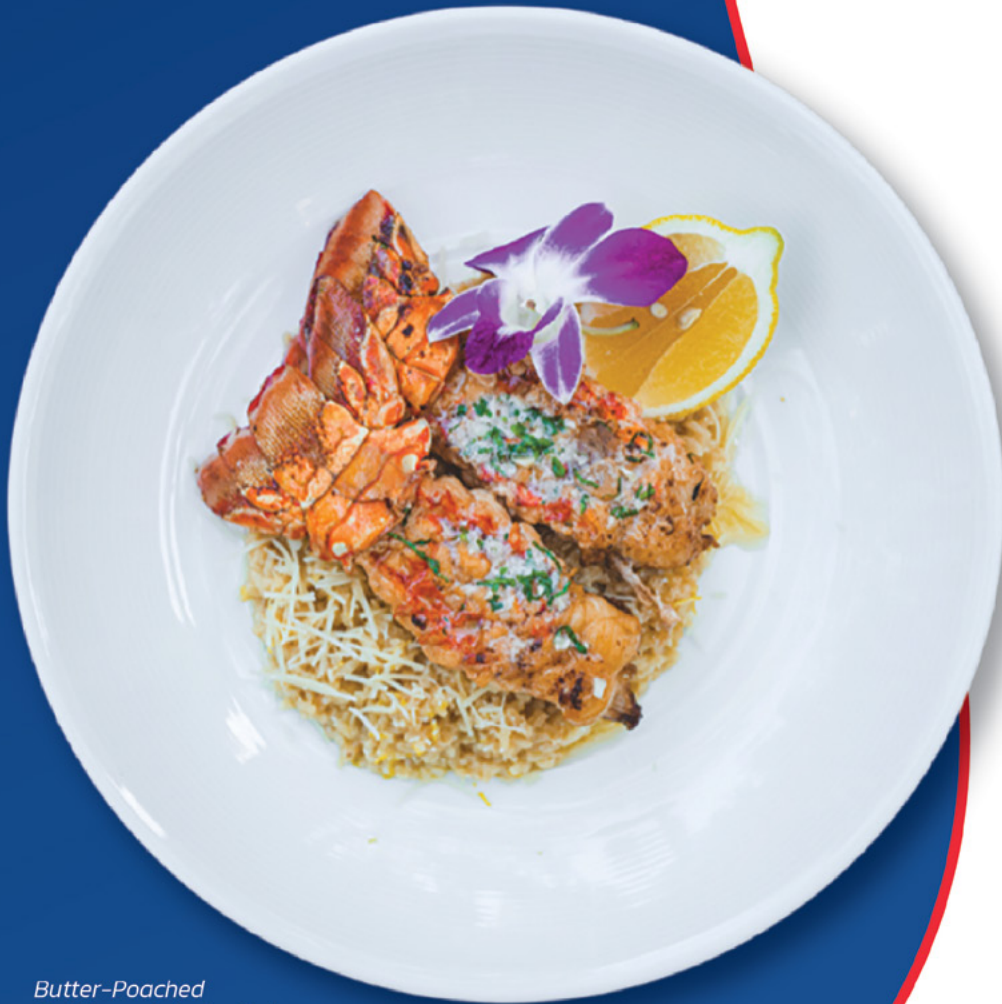
Butter-Poached Caribbean Lobster Tails