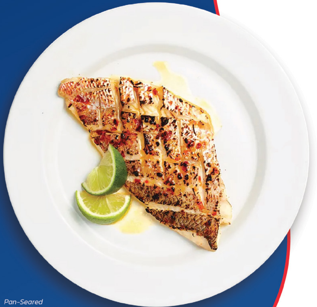
Pan-Seared Caribbean Red Snapper Fillet