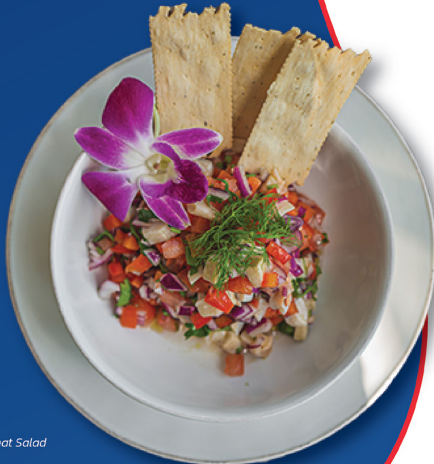
Conch Meat Salad