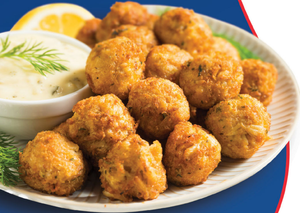
Deep-fried Conch Fritters