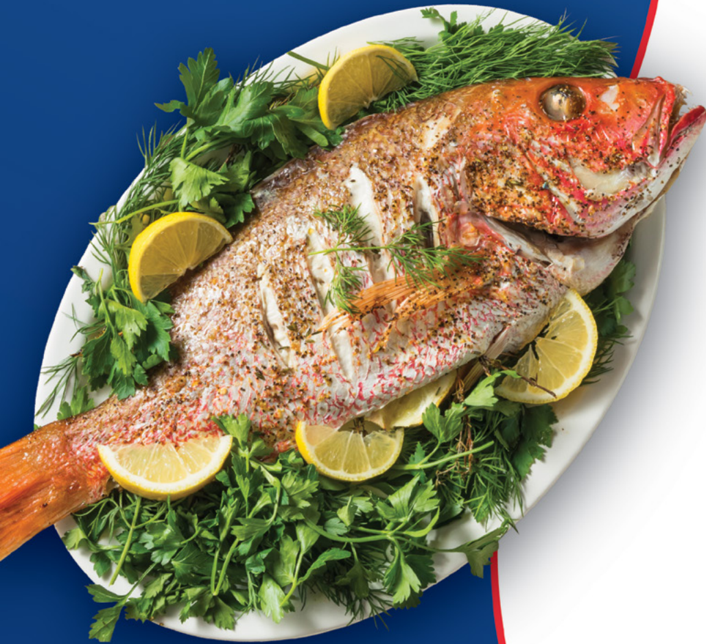
Grilled Whole Caribbean Red Snapper